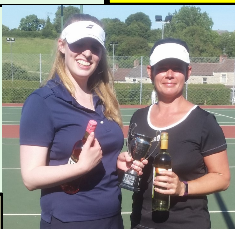
2017 Ladies Doubles Winners