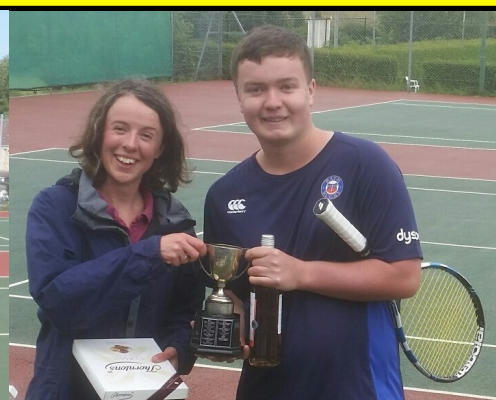
2017 Mixed Doubles Winners